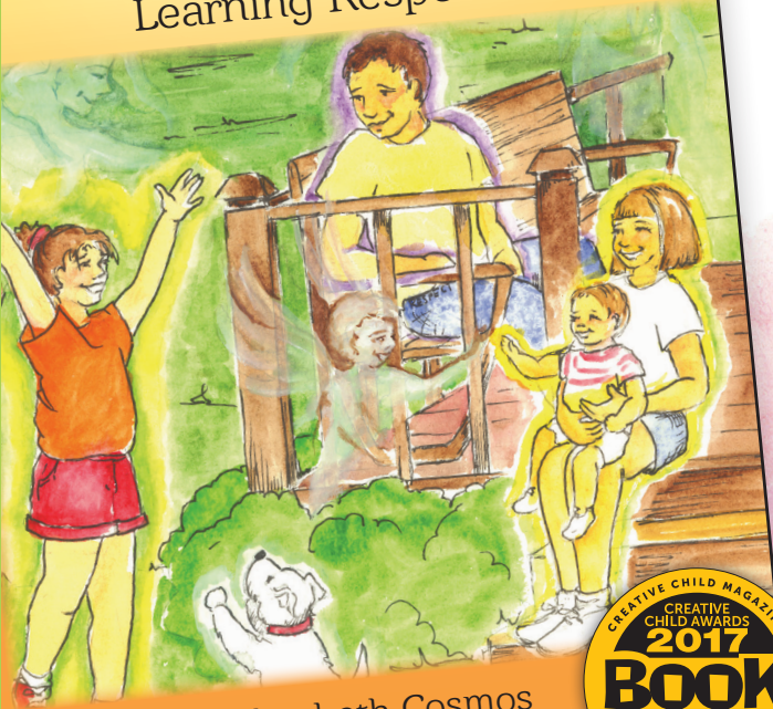
Elizabeth Cosmos